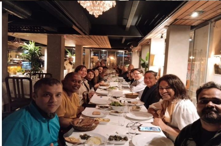
Pic: APRALO @ ICANN 81