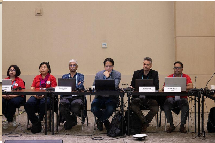
Pic: From APRALO AGM