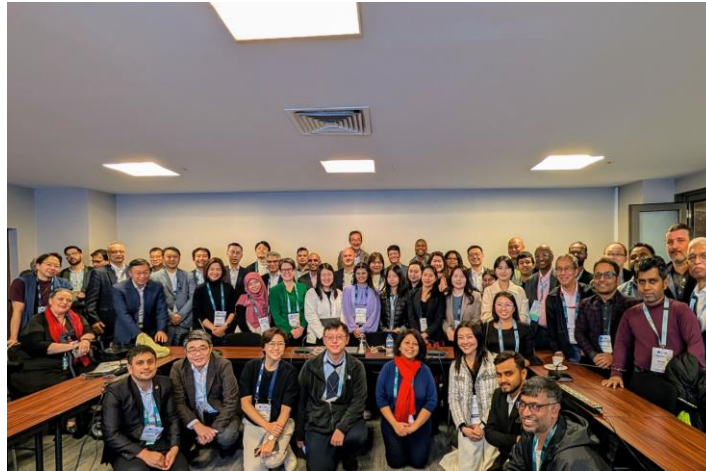
Pic: APAC Hub Meeting @ICANN81